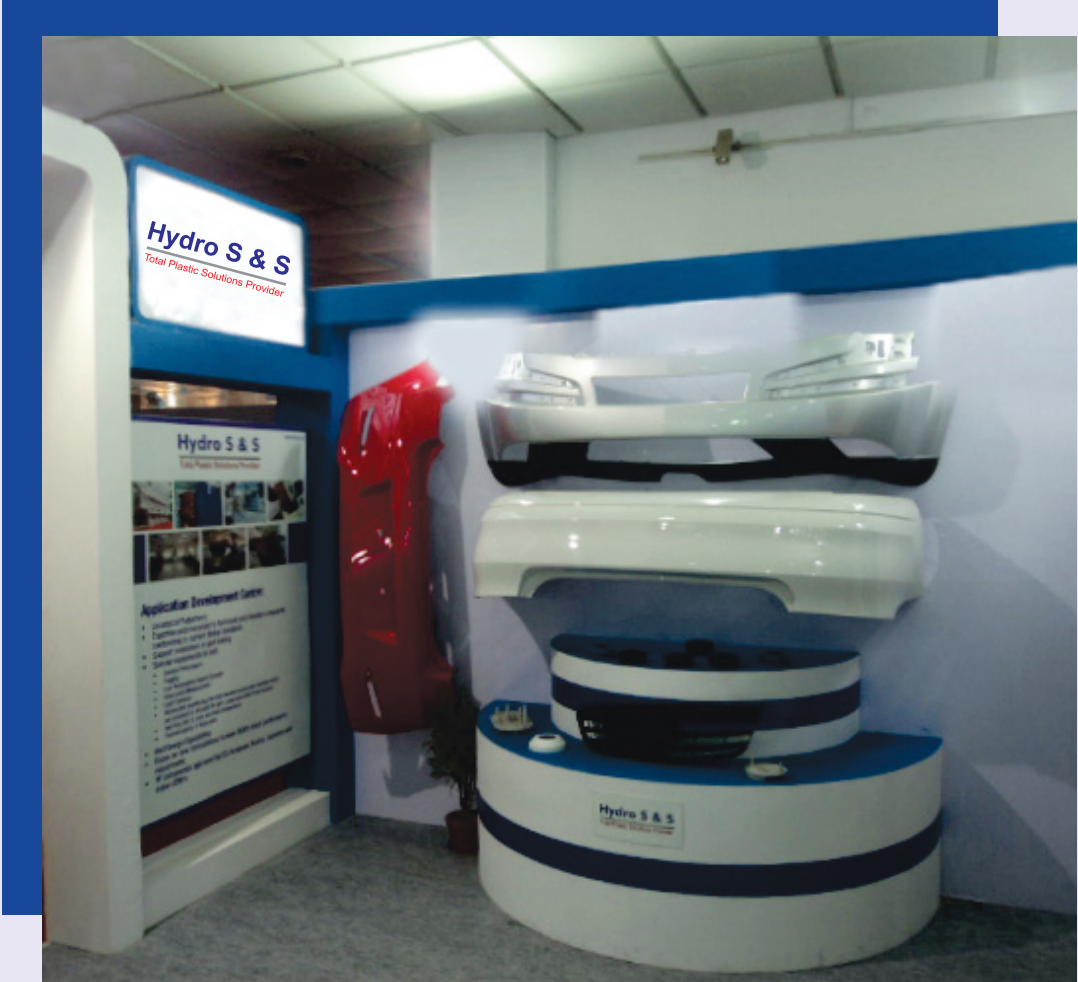
A VIEW OF OUR STALL AT PLAST INDIA 2012