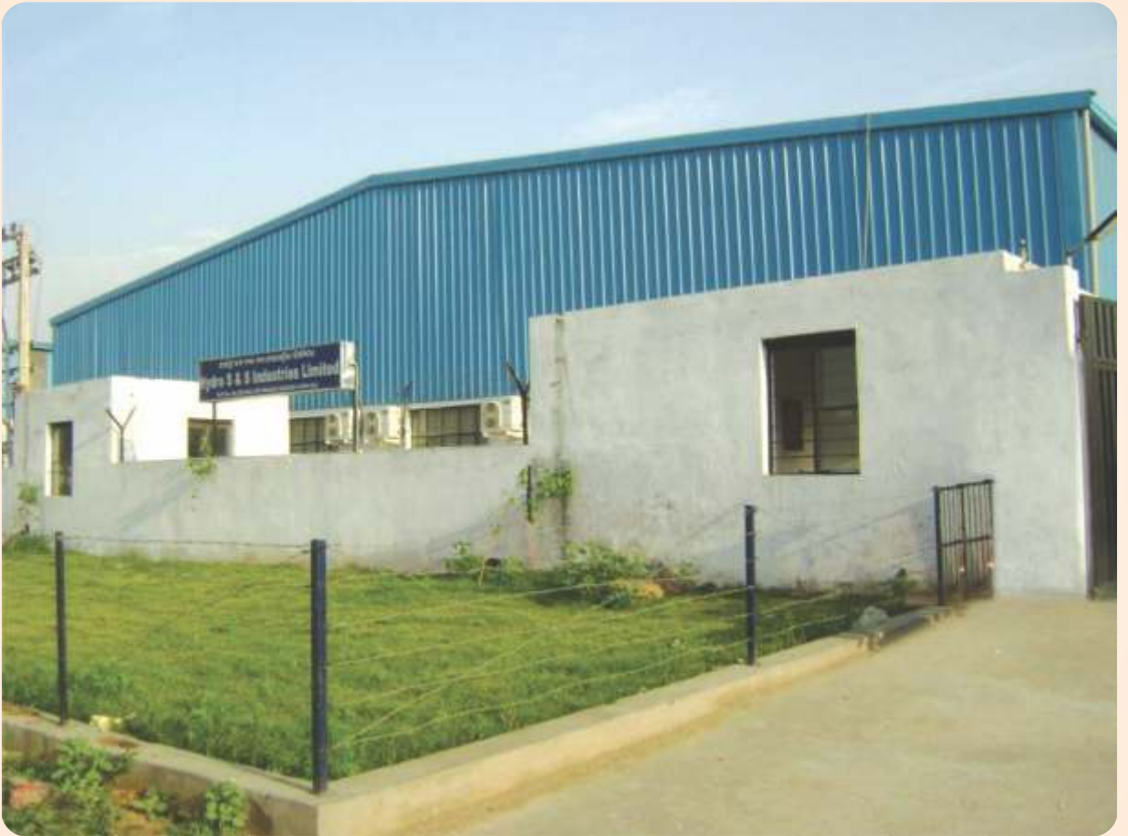
A VIEW OF OUR MANUFACTURING FACILITY AT MANESAR