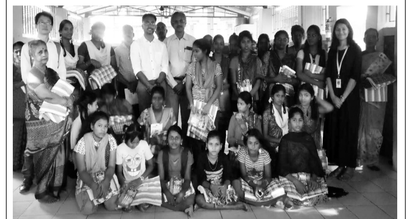
Employees of Kingfa Science & Technology (India) Limited visited Madras Seva Sadan and Mercy Home in Chennai and interacted with underprivileged children, women and elderly citizens as part of their CSR activity.

Priyanka Gandhi will take over as AICC general secretary for UP East in the first week of February, the party said.